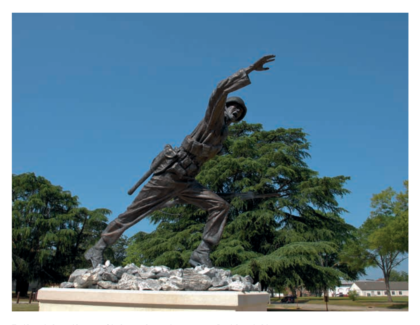
Third Principle: Personal Directions of the Supreme Commander