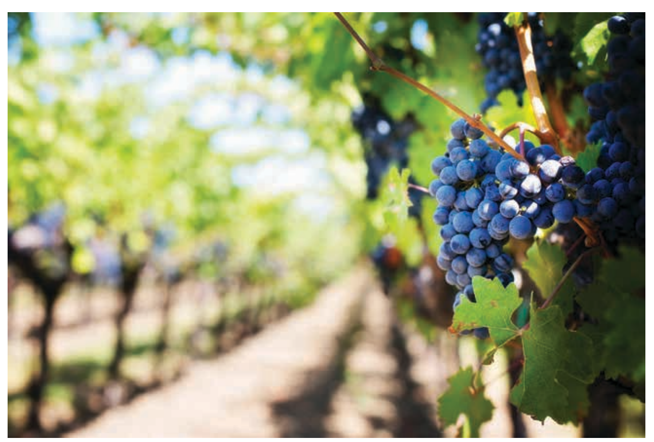
Fri 26 - Sun 28 October 2018 - Brisbane