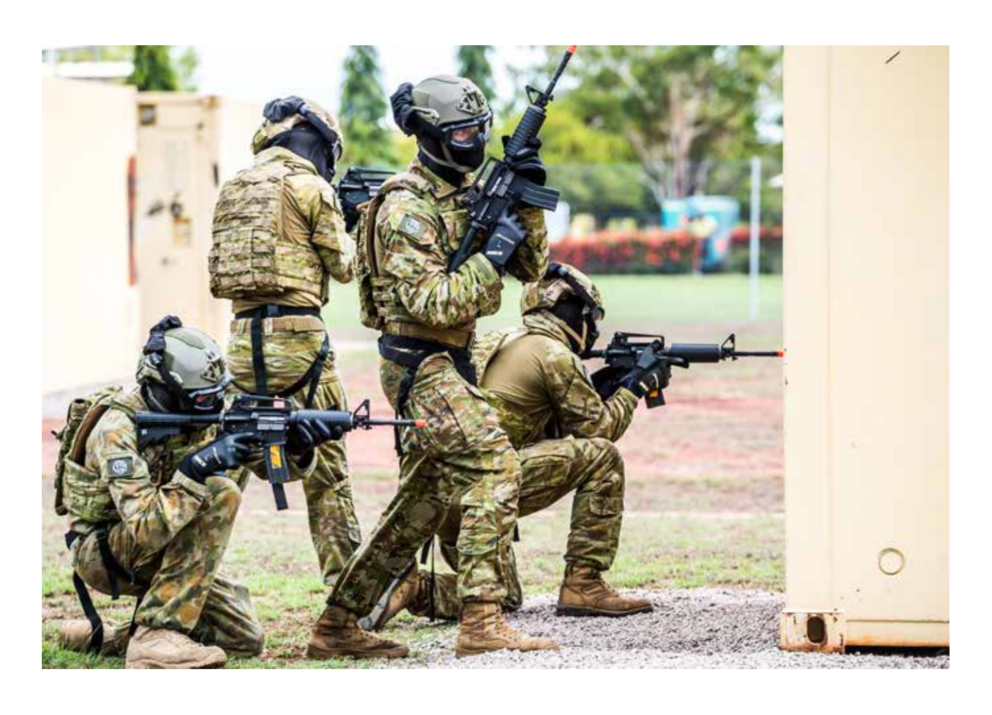
For God has not given us a spirit of fear, but of power and of love and of a sound mind.